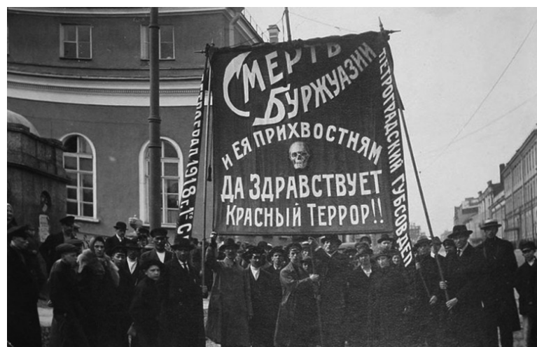
Photo: Bolshevik demonstration with a banner «Death to the bourgeoisie and its henchmen. Long live the Red Terror!»